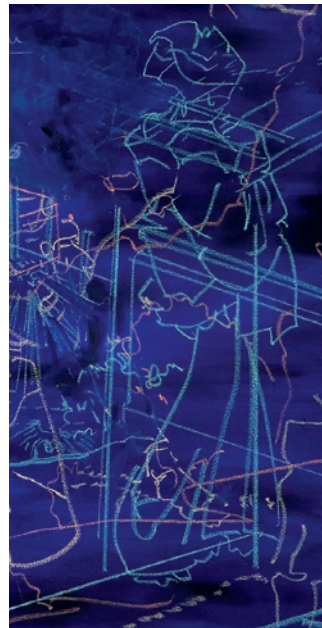
Table Talk benefits the Women's Studies Program and the Women's Archive and Research Center (ARC) at the University of Houston. The Women's ARC was established in 1996 to collect, preserve and share the stories of women's contributions to the life and culture of Texas and Houston. Our focus is the written records and oral histories of women's organizations and of individual women who have affected our lives.

Table Talk is a fascinating combination of conversations over lunch, led by dynamic women of various cultures, professions and experience at each table.